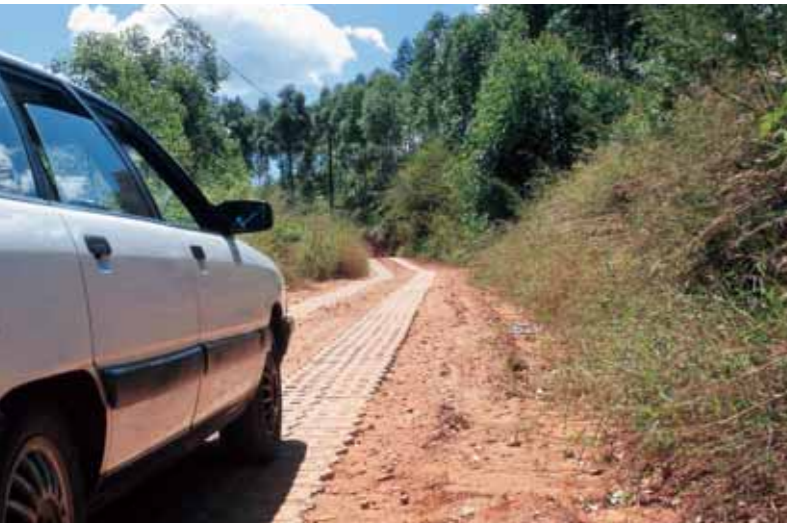
Armorflex as strip road in forest area