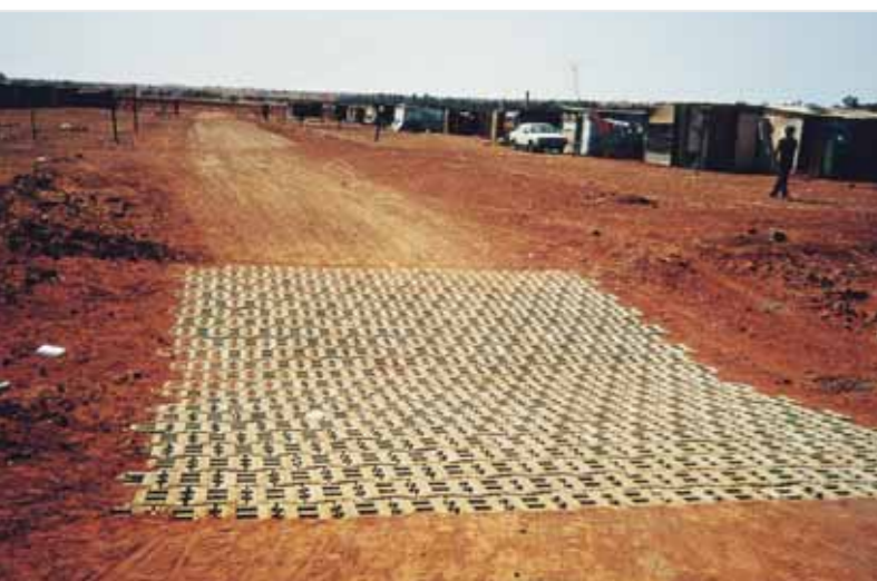
Armorflex lined stormwater crossing of gravel and surfaced roads