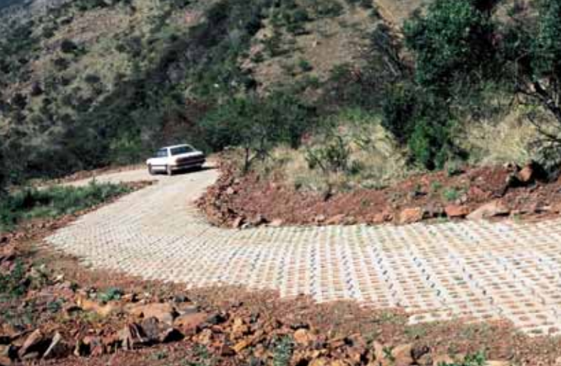
Full width Armorflex surfacing on very steep road