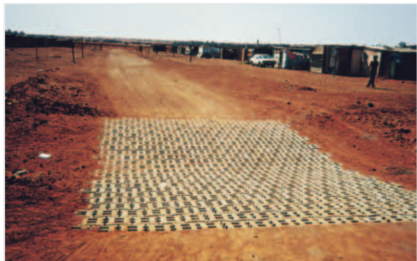
Armorflex lined stormwater crossing of gravel and surfaced roads