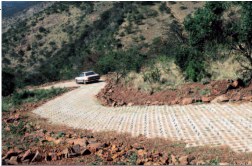
Full width Armorflex surfacing on very steep road