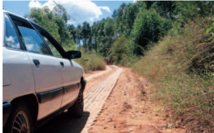
Armorflex as strip road in forest area