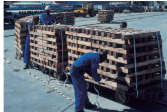
Manufacture carried out on shaft bank where the composite units are packed directly onto mine cars reducing transport and handling costs.

Continued research and testing of the Technicrete Composite Pack ensures quality standards are maintained. All concrete materials are to SABS specifications.