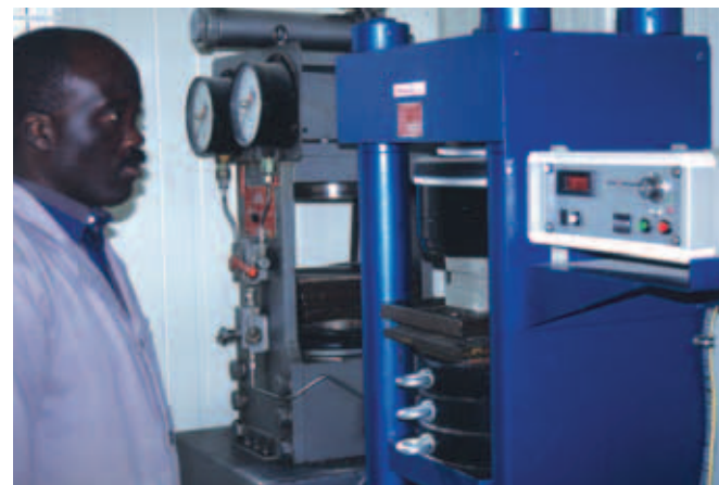
Technicrete Composite Pack element under proof compression test.

Continued research and testing of the Technicrete Composite Pack ensures quality standards are maintained. All concrete materials are to SABS specifications.